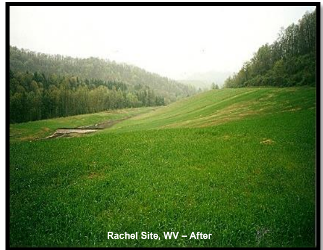
Rachel Site, WV – After