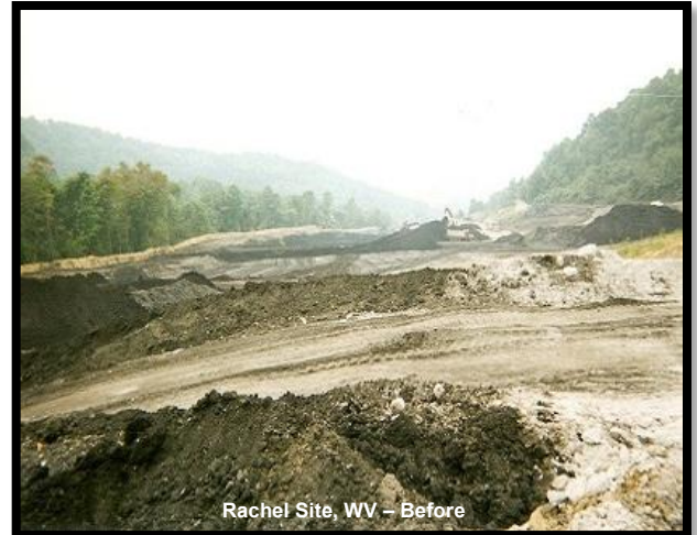
Rachel Site, WV – Before